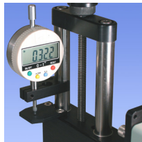
Digital travel indicator