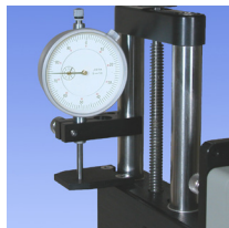
Dial travel indicator