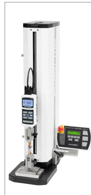
Shown with an ESM303 test stand and G1008 film & paper grips

On-board data memory for up to 50 readings is included, as are statistical calculations with output to a PC. Integrated set points with indicators and outputs are ideal for pass-fail testing and for triggering external devices such as an alarm, relay, or test stand. The gauges are overload protected to 200% of capacity, and an analog load bar is shown on the display for graphical representation of applied force.