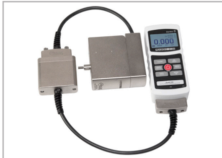
AC1084 Plug & Test® Extension cable

Adapts a Series FS05 load cell to Plug & Test® type interface, for use with a Mark-10 indicator. Also allows for mounting to Models F755(S) and F1505(S). Shown above with Model M5I indicator.