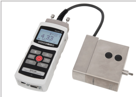
AC1083 Adapter, FS05 to Plug & Test® connector

Adapts a Series FS05 load cell to Plug & Test® type interface, for use with a Mark-10 indicator. Also allows for mounting to Models F755(S) and F1505(S). Shown above with Model M5I indicator.