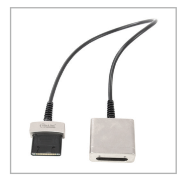
AC1084 Plug & Test<sup>®</sup> Extension cable 24 in. / 610 mm extension facilitates easier connection to a Model M5I or M7I indicator for calibration.